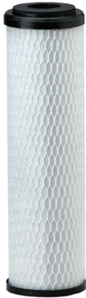
CG5-10S Replacement Cartridge: DEV9108-17