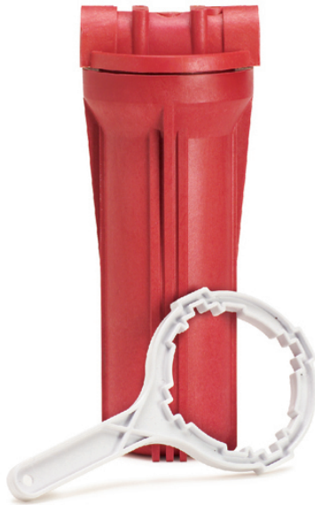
Kleenware HTS-11 System: EV9799-11 HT-10 Replacement Cartridge: EV9799-22

Scale prevention and corrosion control for warewashing equipment