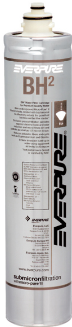
BH 2 Replacement Cartridge: EV9612-50

Delivers premium quality water for coffee applications