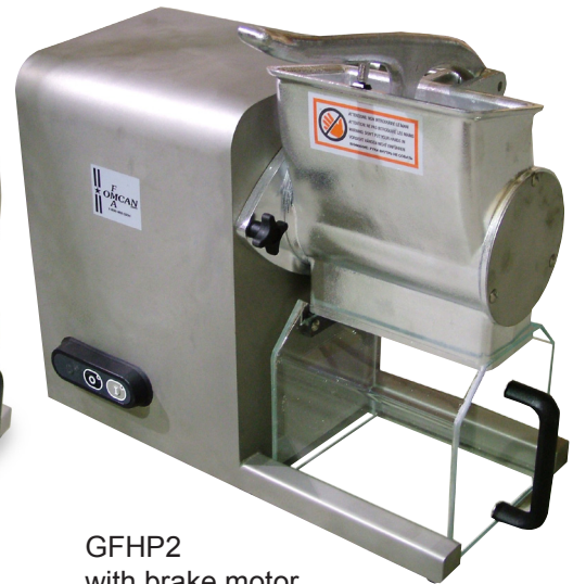
GFHP2 with brake motor