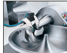
Standard removable 6 and 3-knife head.