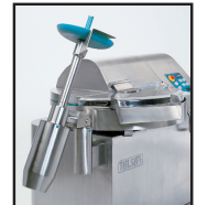
Optional motorized unloader