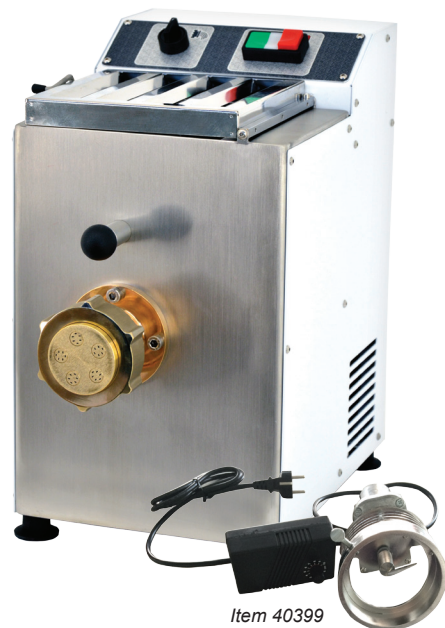
Item 40399 Optional Cutter assembly for PM-IT-0004