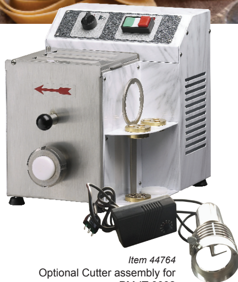
Item 44764 Optional Cutter assembly for PM-IT-0002