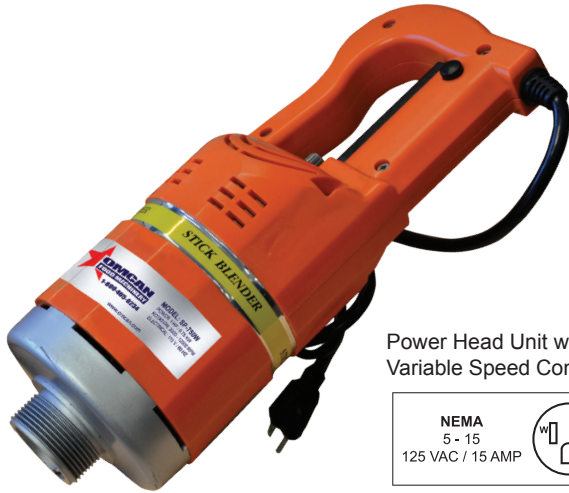
Power Head Unit with Variable Speed Control