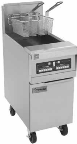
Shown with optional CM3.5 controller and casters