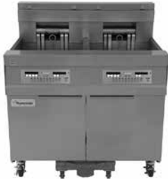
Model Shown: 21814E with optional filtration