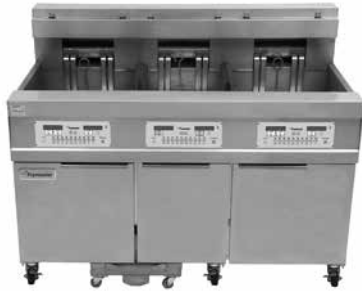
Model Shown: 11814E/RE17/11814E