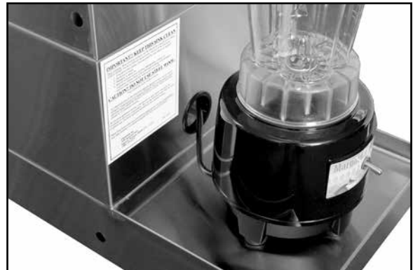
Power cord access hole in front skirt, behind blender