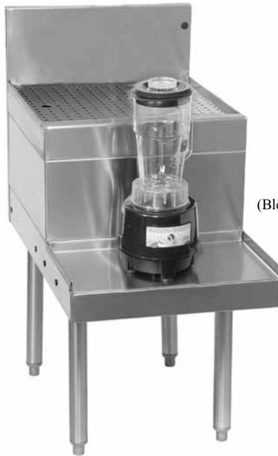
DBSB-18 (Blender not included)

DBSA-12, DBSA-14, DBSA-18, DBSA-24, DBSB-12, DBSB-14, DBSB-18