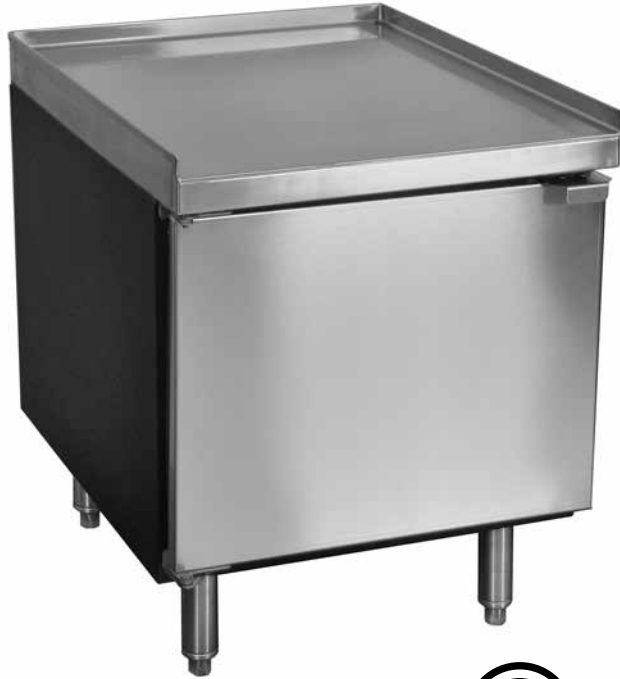
MS20-SS(L) with CLS-4 leg set accessory