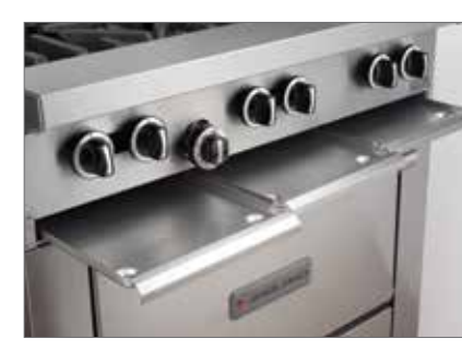
Fully sealed split crumb travs easier and safer to handle