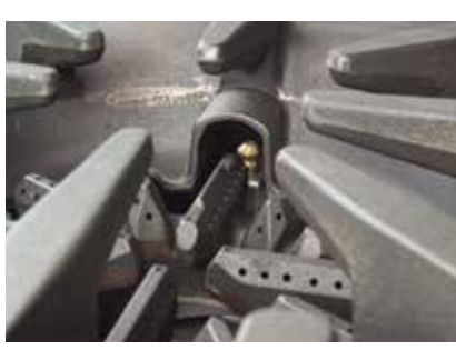
Pilot Lights are protected outside of the spill zone

results and industry leading recovery are achieved by unmatched temperature consistency and simply the best