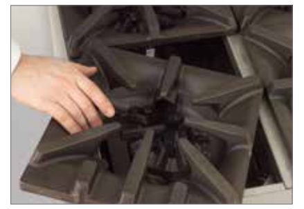
Split ergonomic grates are easier to handle and clean

The all porcelain oven with removable racks and guide makes oven clean-up a breeze.