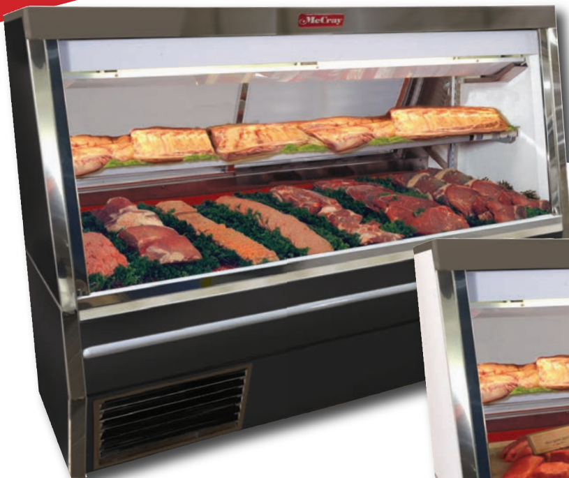
Shown with Optional Mezzanine Shelf