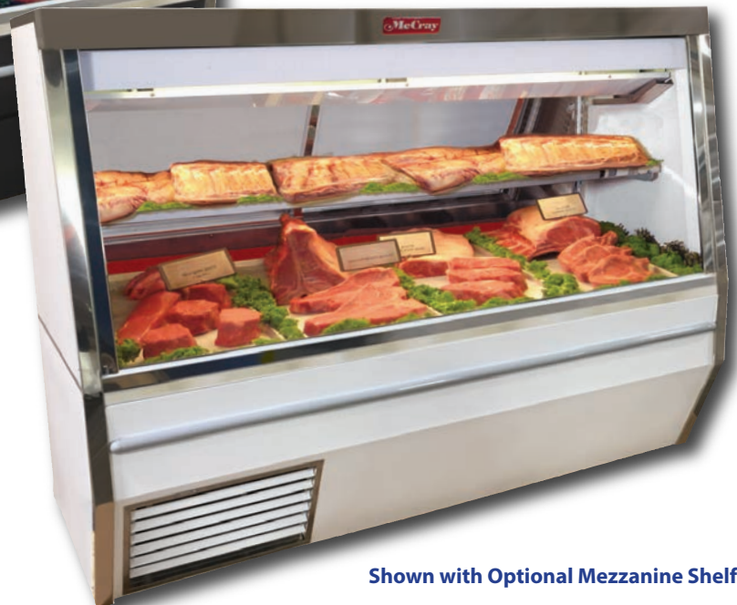
Shown with Optional Mezzanine Shelf