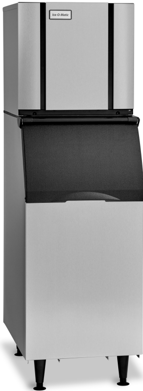
CIMO520 ON B42