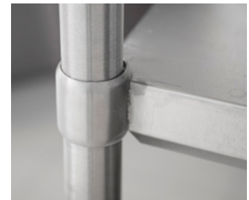
ADJUSTABLE LOWER SHELF