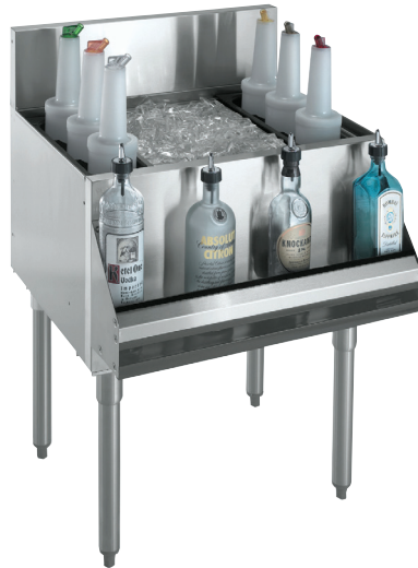
KR18-24-10 Shown with optional Speedrail Available in 1800 or 2100 Series