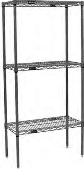
decorative three-shelf unit