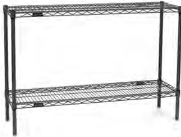
decorative two-shelf unit