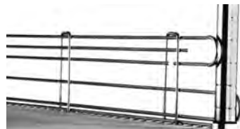
4" (102mm)-high ledge