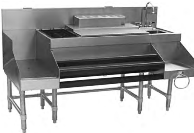
combination cocktail station

Eagle Spec-Bar® Combination Cocktail Station; model _____. Heavy gauge type 304 stainless steel body, legs, leg channels and cross rails. Models offered with (12" or 18") recessed workboard with 1½" drain and stainless steel removable perforated insert, or with (12" or 18") tiered liquor display with ABS for sound deadening—#CCS-72 has both. (36" or 42") combination foamed-in-place insulated ice chest with bottle holders. Two ¾" x 2½" tubing access holes in top of backsplash. Dry waste chute. Condiment dispenser. 12" single wet waste sink with T&S faucet and perforated lift-out strainer. Stainless steel blender shelf with towel ring and rear cord access hole. Stainless steel double speed rail with ABS for sound deadening, and stainless steel adjustable bullet feet.