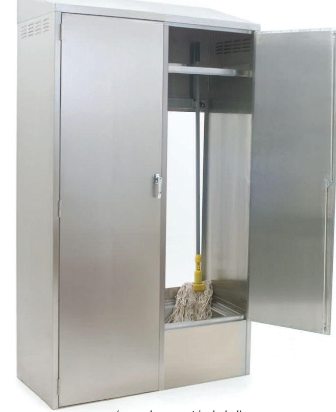
(mop shown not included)

The new Double-Width Mop Sink Cabinets is the perfect storage unit for all of your cleaning supplies and equipment. One side features three intermediate shelves for storage, and the other side features an overhead shelf, two-pole mop holder and a 16" x 20" x 8"-deep mop sink with drain. The 84" height allows for plenty of space to store all of your cleaning supplies, mops, and mobile mop bucket. Other features include louvers along the top of each side panel for ventilation, a sloped top for ease of cleaning, service faucet, 30" hose and wall mounted bracket. Available with mop sink on the left- or right-hand side.