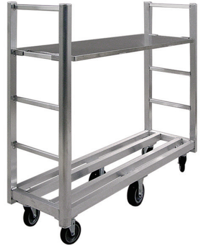
95762 With 95762RS