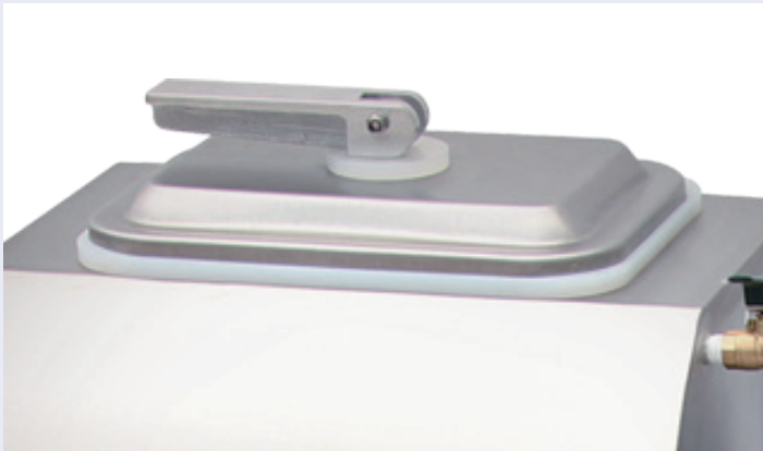
VACUUM SEAL LID