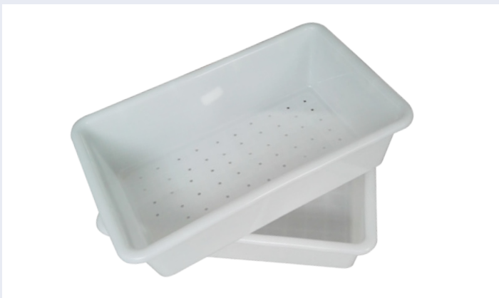
PLASTIC MARINATOR FILLING AND STORE SALVER