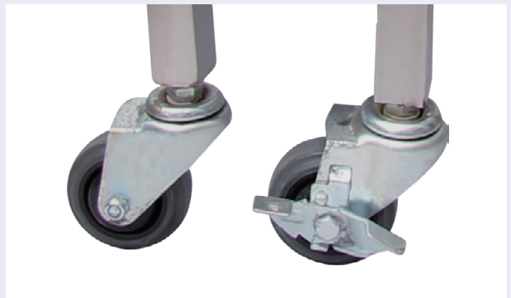
4 UNIVERSAL CASTERS (2 WITH LOCKS)