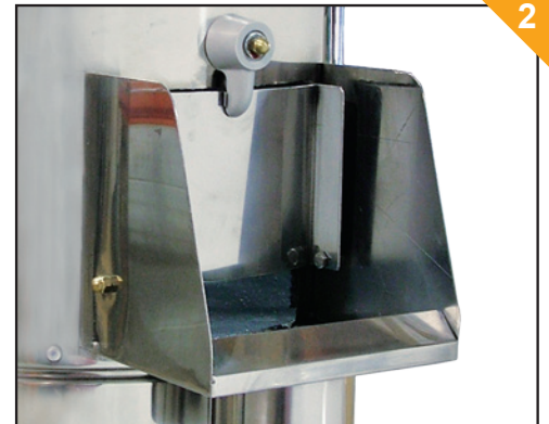
Bolt & Door