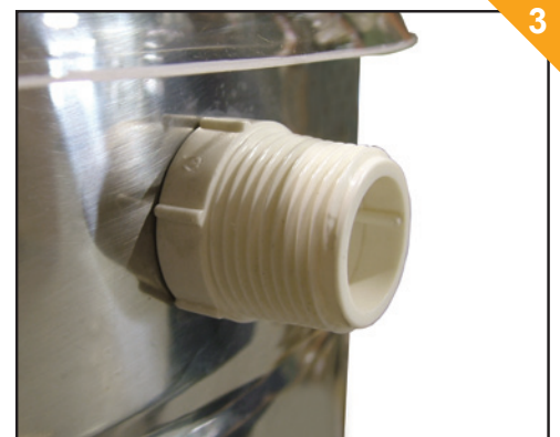
Water Inlet - 3/4" Pipe