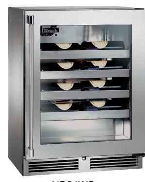
HD24WS Shown with Glass with Stainless Steel Frame Door (S)