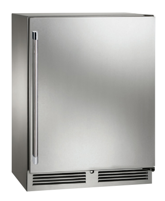
HD24RS Shown with Solid Stainless Steel Door (S)