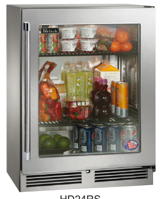
HD24RS Shown with Glass with Stainless Steel Frame Door (S)