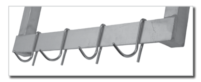
POTHOOKs Shown on Pot Rack Wall Shelf