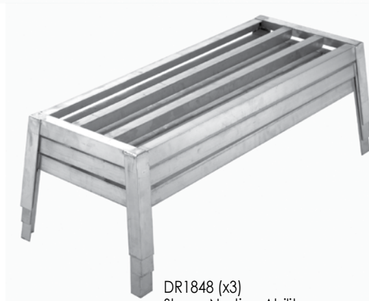
DR1848 (x3) Shows Nesting Ability