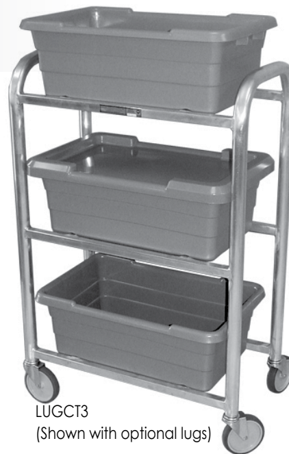
LUGCT3 (Shown with optional lugs)