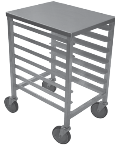
WE3018-7W-ST (Shown with optional stainless top)

Tops: Poly, Stainless or Aluminum (PT, ST, AT)