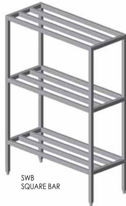
SWB SQUARE BAR