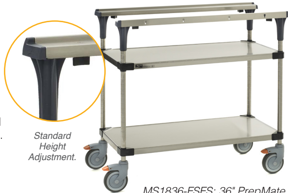
Standard Height Adjustment.