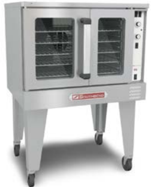
(SLES/10SC shown with optional casters)

SLES/10SC, SLES/10CCH SLEB/10SC, SLEB/10CCH