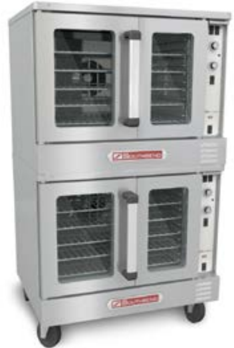
(SLES/20SC shown with optional casters)

SLES/20SC, SLES/20CCH SLEB/20SC, SLEB/20CCH