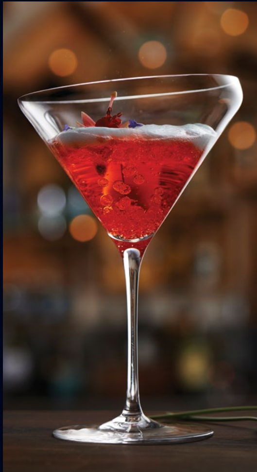
4818R378 Martini (10 oz)