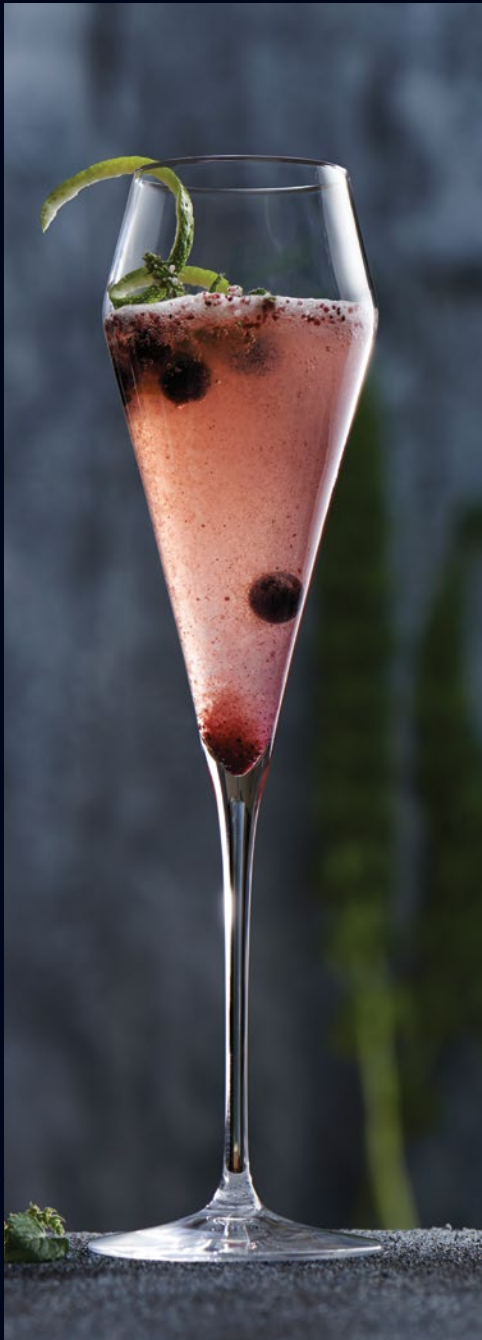
4818R377 Champagne Flute (7 1/2 oz)