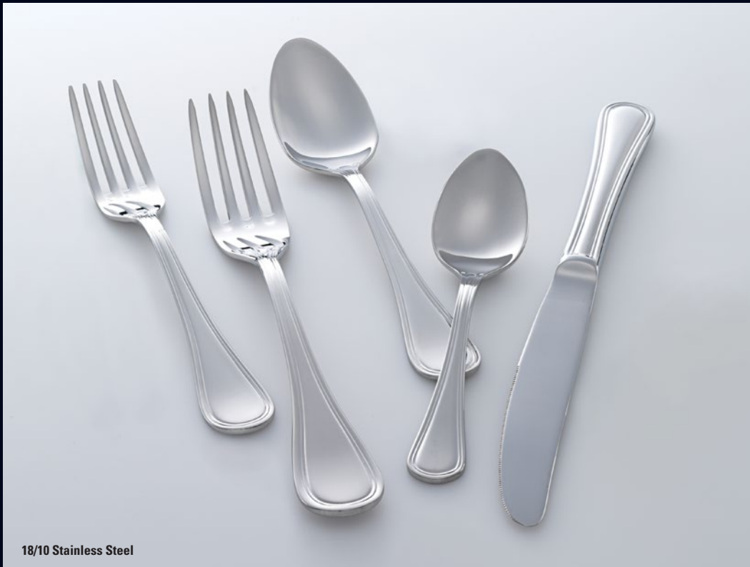
18/10 Stainless Steel