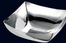
Square Bowl Mirror Finish 5360S324 L W 10" H 3 1/2" (80 oz)