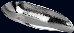
Almond-Shaped Bowl Hammered Finish 5360S302 L 16" W 6 1/2" H 2 3/8" (32 oz)