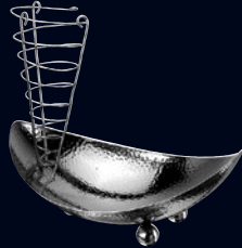
Bread Bowl with Rack Hammered Finish 5360S308 L 11 1/4" W 7 5/8" H 9 5/8"