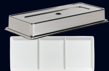
Plate Cover for 3 Compartment Stacking Tray 5371S500 3 Compartment Stacking Tray 6302P279 L 15 7/8" W 6 5/8"