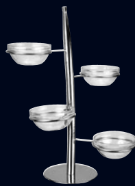
Snack Stand with Glass Bowls 5360S309 L 14 1/2" W 19" Glass Bowls 5360S319 D 4 3/4" H 2" (6 oz)