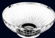
Wire Basket 5360S281 D 9 3/4" H 3 3/4"