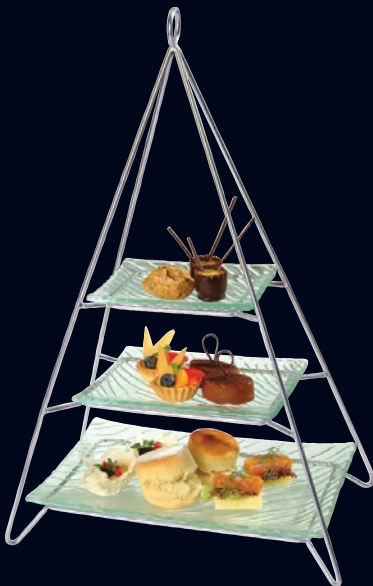
Afternoon Tea Stand-3 Tier with Glass Plates 5360S311 L 13" W 8 1/4" H 20 1/4" Glass Plates Set of 3 for Afternoon Tea Stand 5360S321 Top - L 6 1/4" W 4 3/4" Middle - L 7 7/8" W 5 3/4" Bottom - L 11 3/4" W 7 1/2"