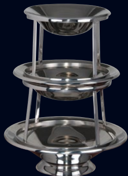
3-Tier Seafood Stand 5850JX04 W 12 3/4" H 17 7/8" W/Double Drain Pans Coupe Style Tier 1 D 12" Tier 2 D 10" Tier 3 D 8"