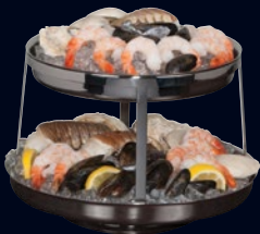
2-Tier Seafood Stand 5850JX01 W 12 1/4" H 9" W/Removable Drain Plates Straight Sided Tier 1 D 12" Tier 2 D 10"