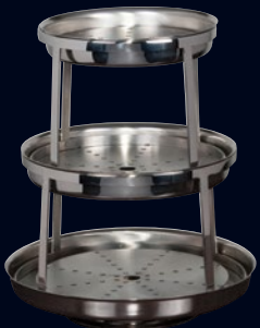
3-Tier Seafood Stand 5850JX00 W 12 1/4" H 15 1/2" W/Removable Drain Plates Straight Sided Tier 1 D 12" Tier 2 D 10" Tier 3 D 8"