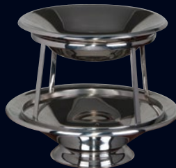
2-Tier Seafood Stand 5850JX05 W 12 3/4" H 10 7/8" W/Double Drain Pans Coupe Style Tier 1 D 12" Tier 2 D 10"