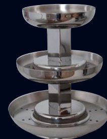
3-Tier Seafood Stand 5850JX08 W 12 1/4" H 14" W/Removable Drain Plates Square Tubing Style Tier 1 D 12" Tier 2 D 10" Tier 3 D 8"