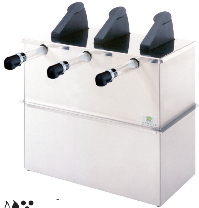
◊●● SE-3DI 07050