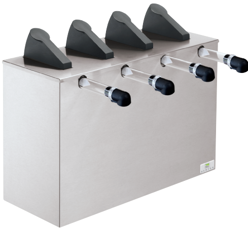
◊●● SE-4 07200