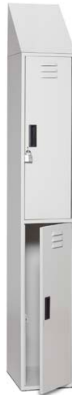
Model L12602P shown with optional ST1512 Slope Top and without legs.