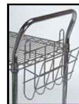
Document Holder see page 69