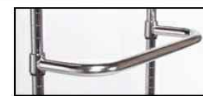
Safety Push Handle see pg. 80