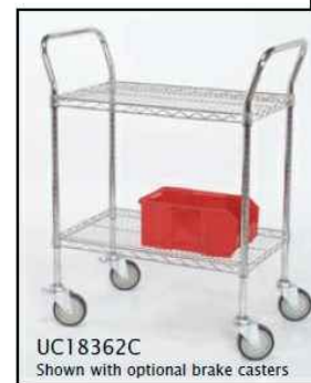
UC18362C Shown with optional brake casters