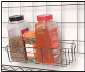
Spice Rack see page 69