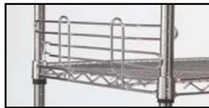
Shelf Ledge see page 76