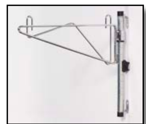
Adjustable Post Bracket System see page 67