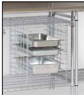
Tray Slide Inserts see page 77