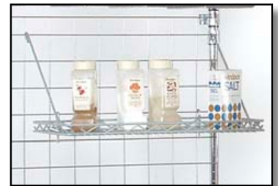
Small Grid Shelf see page 69