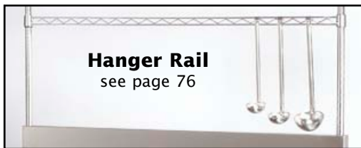
Hanger Rail see page 76