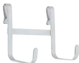
Double "J" Hook see page 69