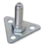
Foot Plates see page 79