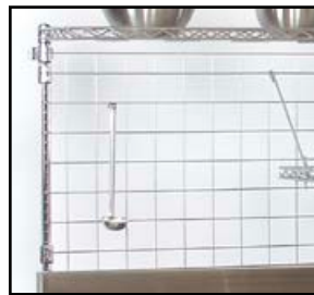
Back Grid Plate see page 68