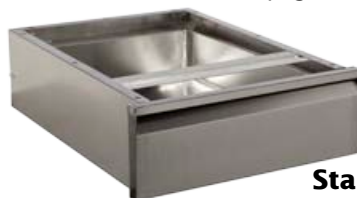
Stainless Steel Drawer Assembly see page 23