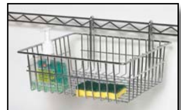
Utility Basket see page 69