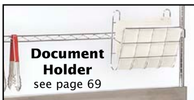
Document Holder see page 69