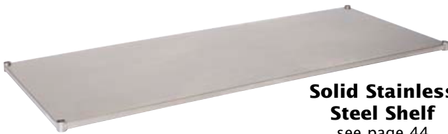
Solid Stainless Steel Shelf see page 44