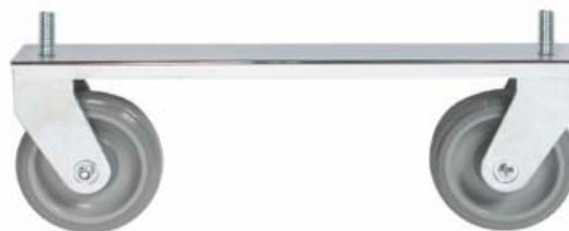
Shown with 5" Polyurethane Rigid Casters Model No. C5SPR