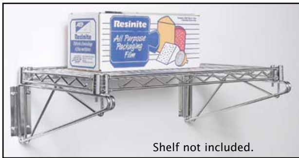
Shelf not included.

For assembly instructions visit www.tarrison.com