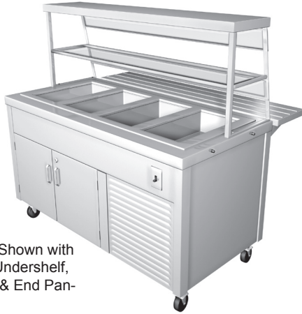
Model #CFCR-4-63 Shown with Optional Trayslide, Undershelf, Display Case, Front & End Panels & Doors

Modular Cold Food Counters with Refrigerated Cold Pan are convenient and easy to use. It allows the ability to add on attractive dessert, salad or cold food display to your serving line while maintaining them fresh. These sturdy units are designed for long lasting service. Units are provided with interlocking devices for quick and easy assembly and disconnecting.