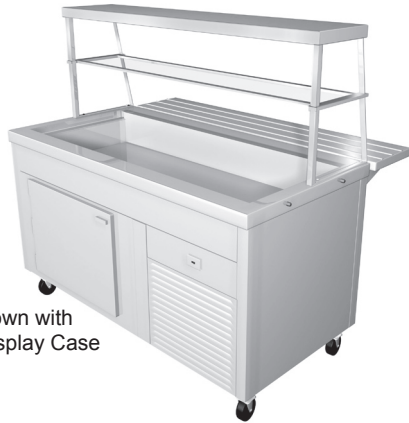
Model #CRBC-63 Shown with Optional Trayslide, Display Case

Modular Cold Food Counters with Refrigerated Base & Cold Pan are convenient and easy to use. These sturdy units are designed for long lasting service. Units are provided with interlocking devices for quick and easy assembly and disconnecting.