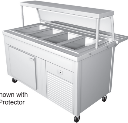
Model #SCRB-63 Shown with Optional Trayslide, Protector Case

Modular Sandwich Counters with Refrigerated Base are convenient and easy to use. These sturdy units are designed for long lasting service. Units are provided with interlocking devices for quick and easy assembly and disconnecting.