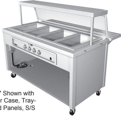
Model #SHF-5-77 Shown with Optional Protector Case, Tray-slide, Front & End Panels, S/S Undershef

Modular Hot Food Counters are electrically heated with individual controls. These functional units are designed to keep hot foods hot at your desired temperature levels. Heated drop-in pans can be used dry or wet and accommodate full size pans. Each well is provided with its own thermostat control. These sturdy units are designed for long lasting service. Units are provided with interlocking devices for quick and easy assembly and disconnecting.