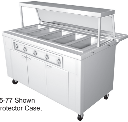
Model #SHFC-5-77 Shown with Optional Protector Case, Trayslide

Modular Hot Food Counters with Heated Compartment are electrically heated with individual controls. These functional units are designed to keep hot foods hot at your desired temperature levels. Heated drop-in pans can be used dry or wet and accomodate full size pans. Each well is provided with it's own thermostat control. Furthermore, unit has a heated base with pan slide assembly for back-up storage. These sturdy units are designed for long lasting service. Units are provided with interlocking devices for quick and easy assembly and disconnecting.