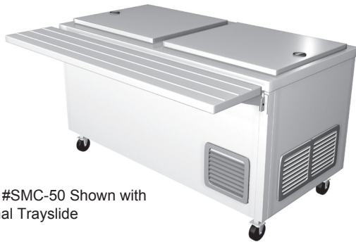
Model #SMC-50 Shown with Optional Trayslide

Modular Milk Counters are convenient and easy to use. These sturdy units are designed for long lasting service. Units are provided with interlocking devices for quick and easy assembly and disconnecting.