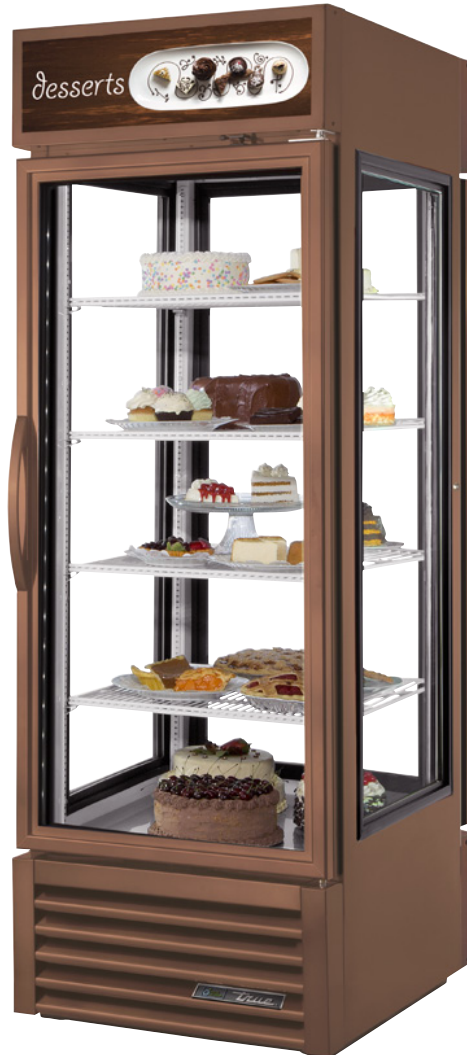
Shown with optional Dessert Sign.

Swing Door Pass-Thru Refrigerator with Hydrocarbon Refrigerant-True Standard Look Version 01