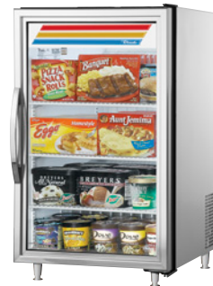
Optional Stainless Exterior