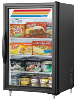
Optional Black Exterior