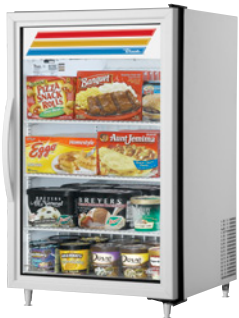
Standard White Exterior